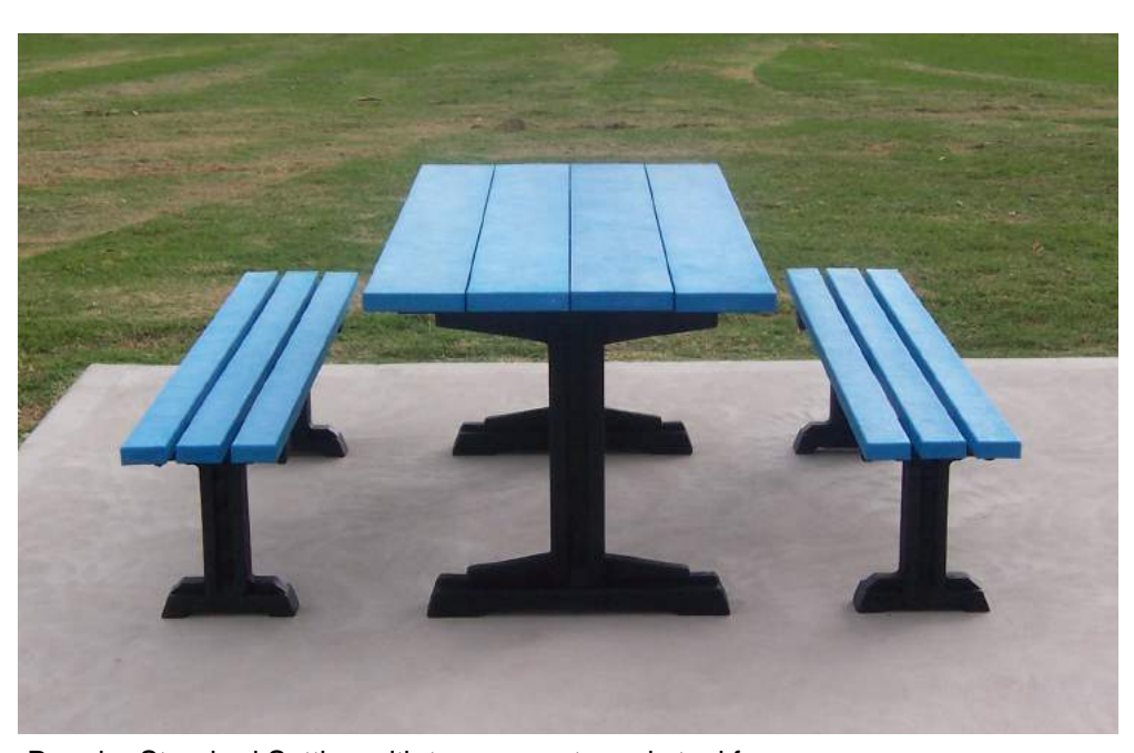
Premier Standard Setting with two supports and steel frame

Unlike other outdoor furniture which require ongoing maintenance, our recycled plastic table settings will not split, splinter or crack, and they never need painting.