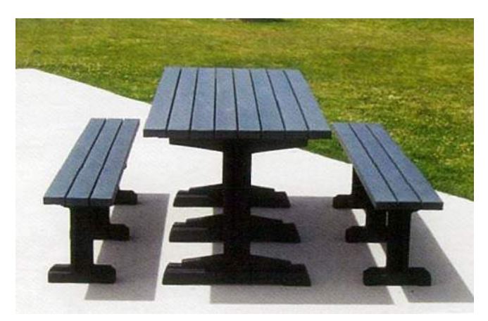
Premier Slimline Setting with three supports

The recycled plastic Premier Setting by Replas offers greater leg room thanks to the clever design of the bench and table supports. The use of a galvanised steel frame means that only two legs are required to support both benches and table. A three support option without the steel frame is available if preferred.