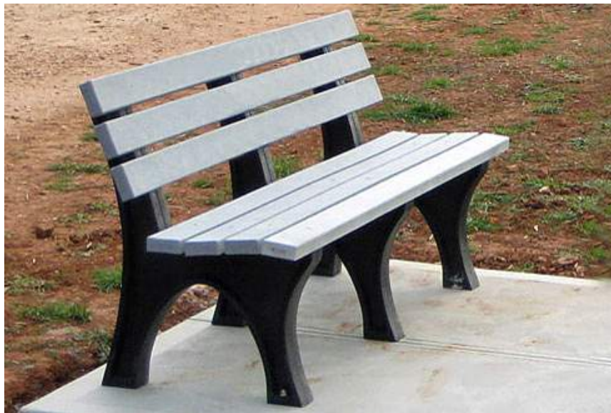
The standard 1.8m Daintree Seat with three supports

The Daintree Seat is available in all the standard Replas furniture colours.