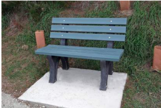
Daintree Seats—1.1m above and 3.6m below

Metal Art Limited Street & Park Furniture